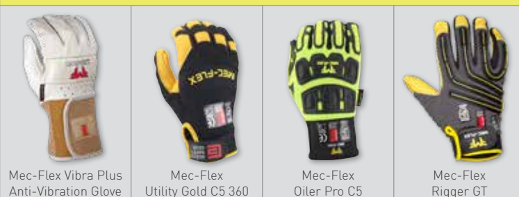
Mec-Flex Vibra Plus Anti-Vibration Glove