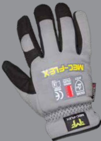
ELG6001 MEC-FLEX QUICKFIT MECHANICS SAFETY GLOVES Mec-Flex Series Glove